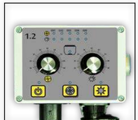
Control box 1.2