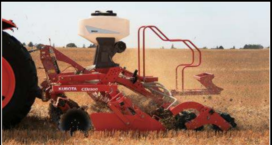
SH200 mounted on a short disc harrow CD2300