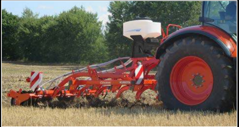
SH200 mounted on a cultivator CU3300C