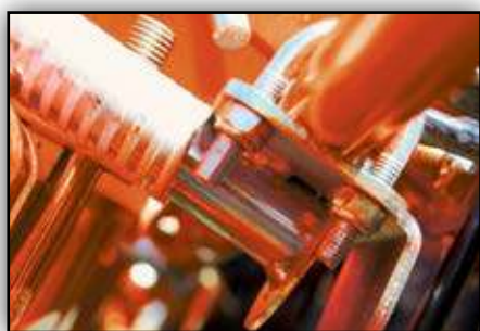
The position of the distribution outlet is before the roller. Position and angle are adjustable.