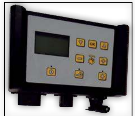
Control box 5.2