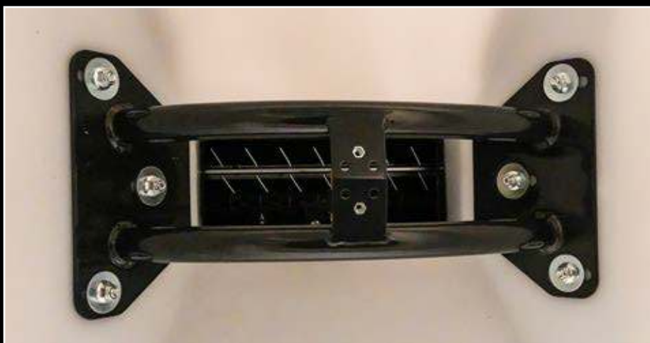
Standard Fill-level sensor on SH500